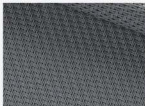
GREY - GREY