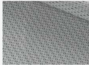
PEARL - GREY