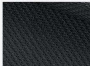
CHARCOAL - CHARCOAL