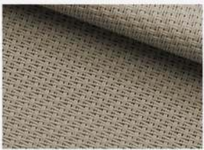
LINEN - LINEN