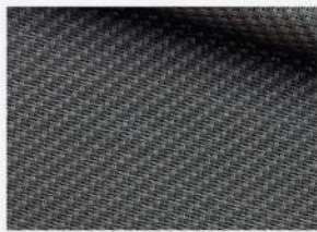
BRONZE - BRONZE