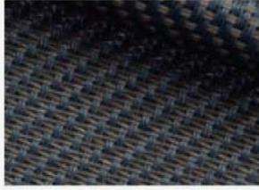
CHARCOAL - BRONZE