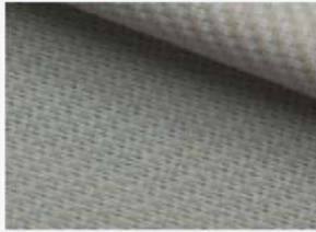
LINEN - WITE