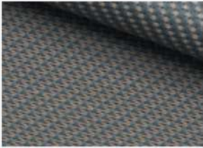
GREY - SAND