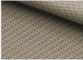
LINEN - LINEN