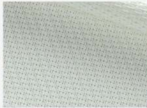
WHITE - WHITE